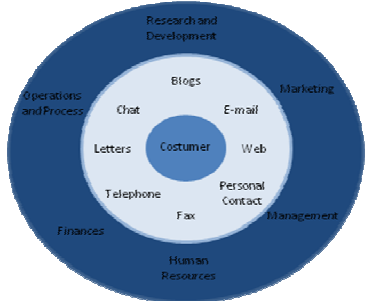
Figure 3 Organization with Focus on Customer

However, some managers think blogs are a virtual diary for people to post about their daily life; it is not anymore the only function of it. The Jeffrey Group, the biggest international independent agency of Public Relations presented studies about the blogosphere and unveil the blogosphere is consolidated, impacting more people and growing more than internet on that region. The blog already is a strong way of communication which is increasing not only in numbers of who is reading it but also in who is writing it <sup>[8]</sup>. And the reason of this enhance it are because the blog can provide a bidirectional communication instantaneous power. It is the fastest channel of communication and aggregate more value for who is reading. The reasons for this enhance are because the blog provide: